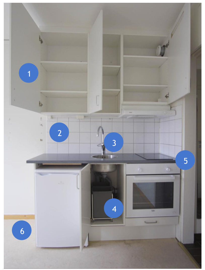
1. Wash the kitchen drawers inside and outside, underneath and on top. Do not forget the handles and the cabinet doors!