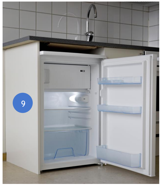
9. Clean your refrigerator and freezer, defrosted them and turn them off. Please leave the refrigerator and freezer with the door open.