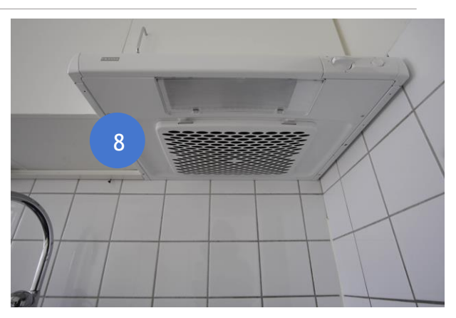
8. Change the filter in your kitchen fan. A new one can be picked up in the customer service office. If you live at Kemivägen 7A or 7B, you have a special filter in your kitchen fan which is made out of metal. You only need to clean it with water and detergent.