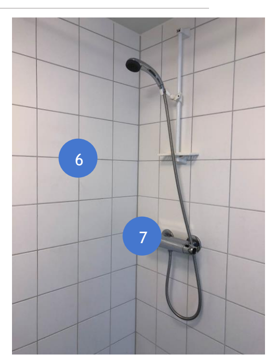
6. Wipe off and clean the walls and floor in the shower, do not forget to empty the floor drain! 7. Clean the shower nozzle and handles