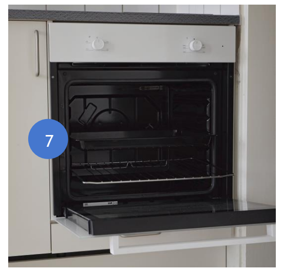
7. Clean the oven, please do not forget the inside and outside of the oven door and handle!